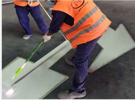
CAR PARK COATINGS