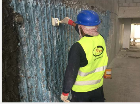
PROTECTION OF STEEL